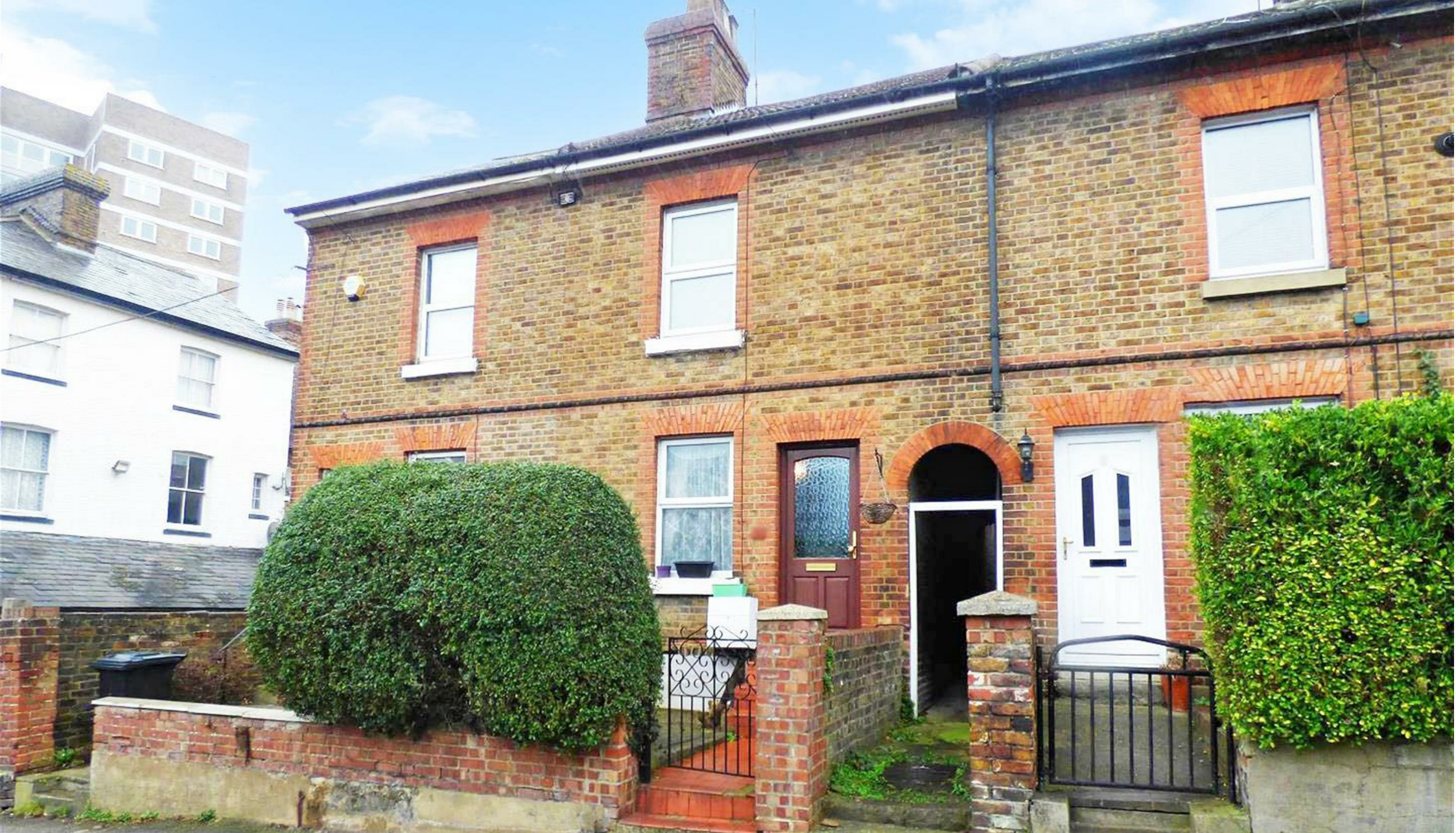
Kingsley Road Maidstone | ME15 7UN